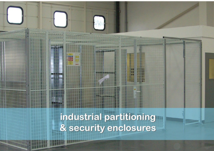
industrial partitioning & security enclosures