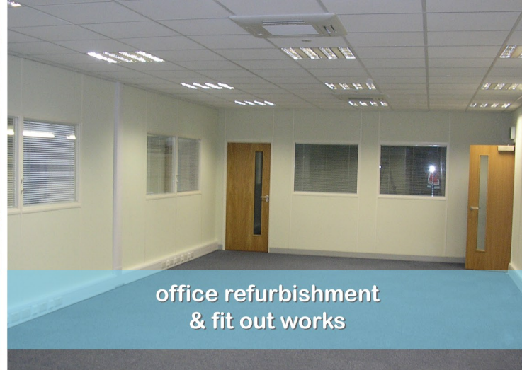
office refurbishment & fit out works