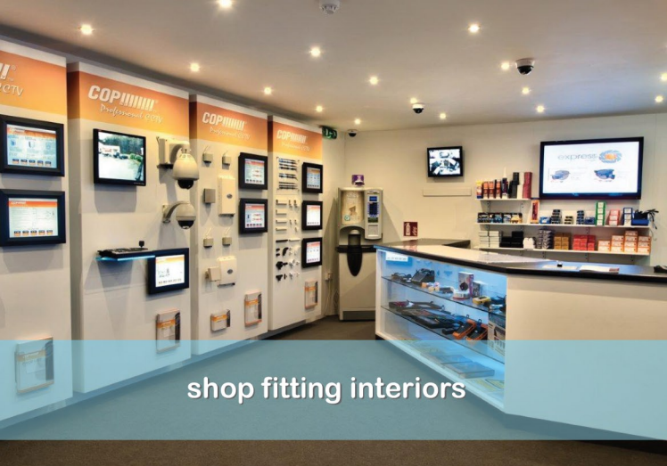
shop fitting interiors