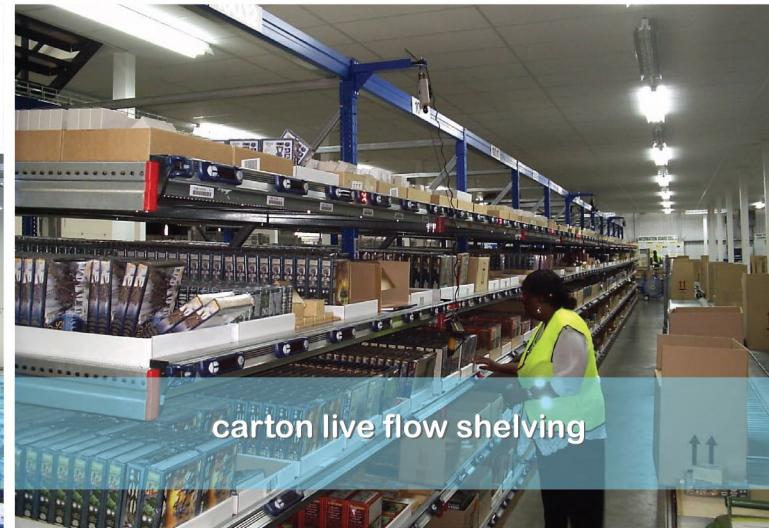
carton live flow shelving

services & installations by T2 storagesolutions www.t2storage.com