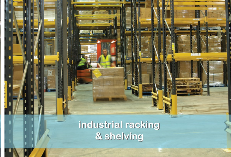
industrial racking & shelving